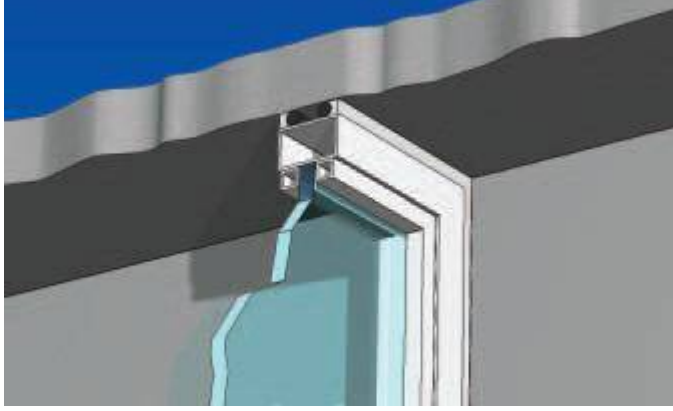
Acrylic Sealant ,Wall/soffit substrate, Window frame